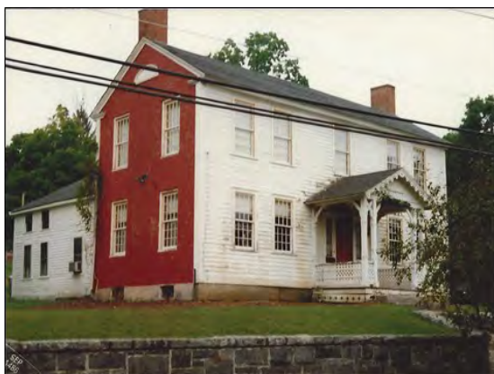
Jacob Thompson House circa 1986

This being said, there were some modernizations that had to be addressed. The kitchen was sort