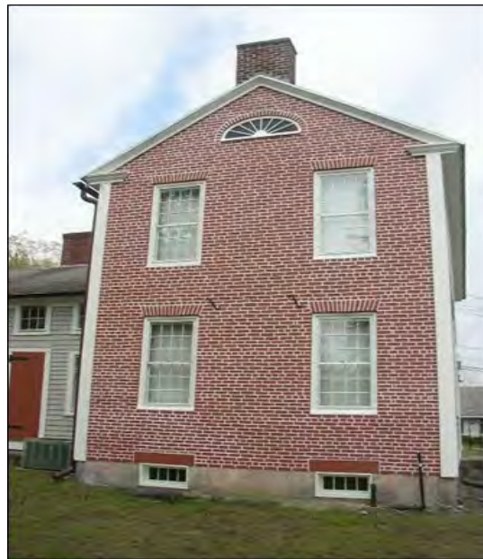
South brick end