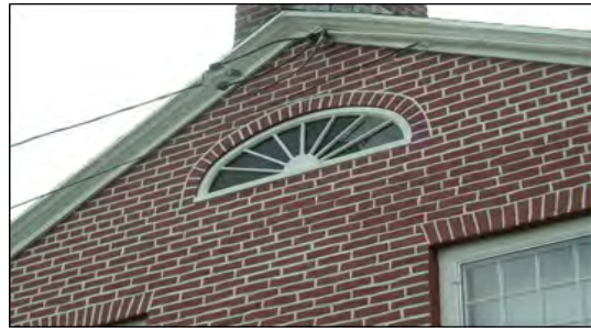
North end showing partial glass fan light window

The exterior of the home has some interesting features also. The most obvious are the brick ends which is very uncommon in this area and I believe they were used as a sort of heat storage in the winter. With a fire in every fireplace, the bulk of the wall behind would radiate heat long after the fires died down. Another heat saving device which we only discovered when removing some of the clapboards for the front porch project was the presence of long strips of birch bark tacked over the spaces in the sheathing to stop air infiltration, a sort of early American house wrap. The fan light window in the attic on the southern side of the house is totally fake and only there for appearance, but the one on the northern side is interesting in that it has a small portion of glass in the corner actually letting light