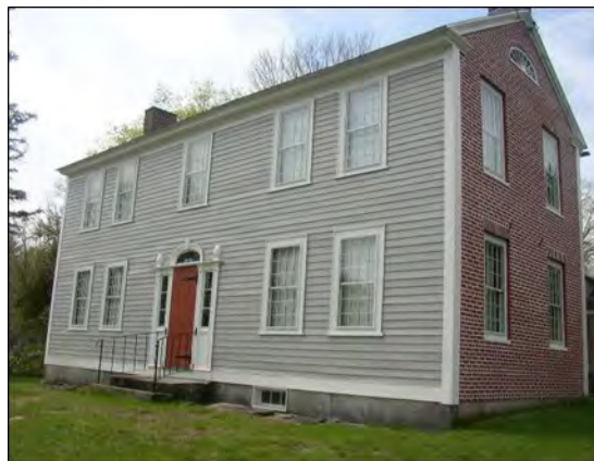
Jacob Thompson House 2016

into the otherwise pitch black attic space. Both of these windows are directly in front of the chimneys.