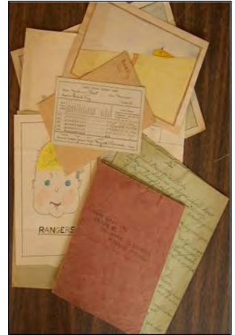
Mechanic Street School 6 th Grade School Pa- pers and Report Card around 1933 (donated by Wilbraham resident)