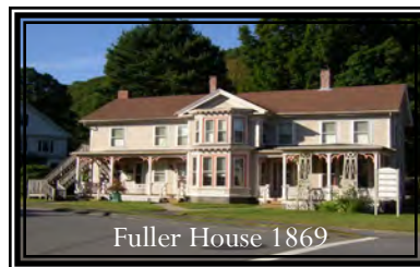
Fuller House 1869