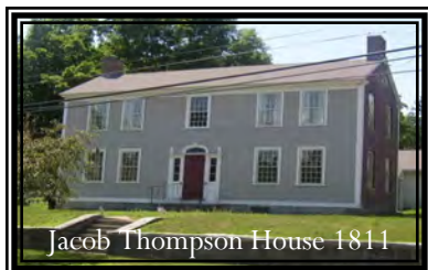
Jacob Thompson House 1811