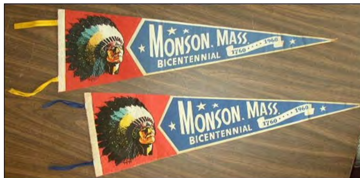
Monson Bicentennial Pennants (donated by Monson resident)