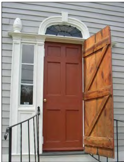
Original Front Door and Surround

of updated in the 50's or 60's, but only to the extent of cabinets and a sink and linoleum on the floor. Over the life of the home, all of the original window sash were replaced haphazardly and by this I mean I have never seen so many different configurations of windows. There were 1 over 1, 2 over 1 or 2, 4 over 4 and some 6 panes thrown in. A Victorian porch in total disrepair had been put on the front in the 1870's or